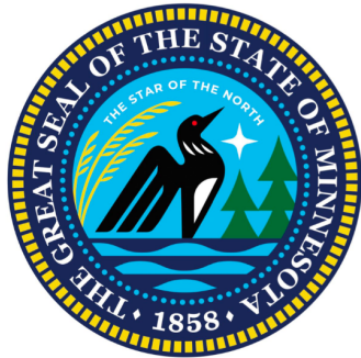
Seal - K