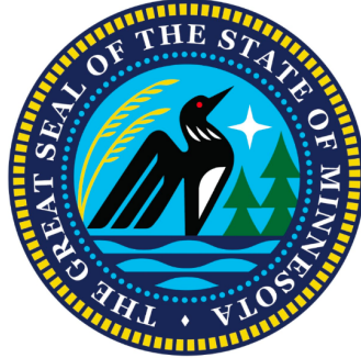
Seal - L